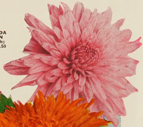
MALINDA BROWN 60c each; 3 for $1.50